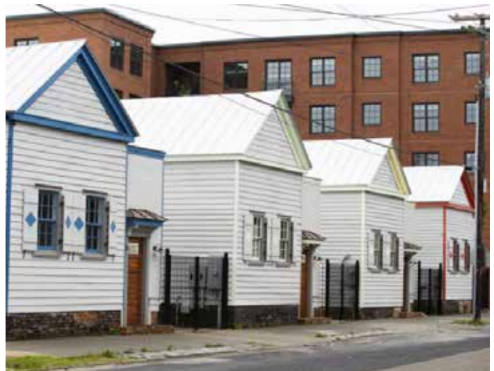
From Top: Seven to Save Site from 2011, Before, After