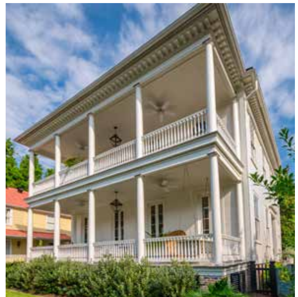
From Top: c.1940s, Before, After